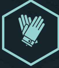
Thick gloves with inner