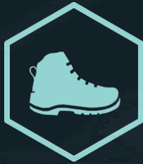
Water-proof Trekking Shoes