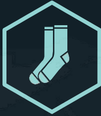
Cotton socks (2 pairseach)