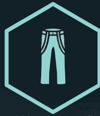
Water-proof trekking pants (1 spare)