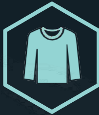
Full sleeve tshirt