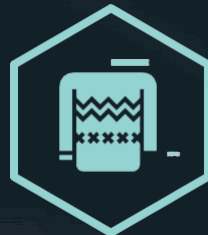
Woollen or fleece sweater/jacket