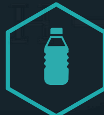
2 ltr. Water bottle