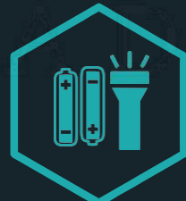
Wearable Flashlight with batteries