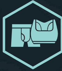
Spare under garments